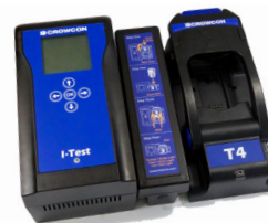
I-Test Easy automated bump testing and calibration solution