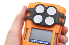
External filter plate Clip-on filter for dusty environments