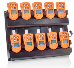
10 way charger For charging and storing your T4 fleet