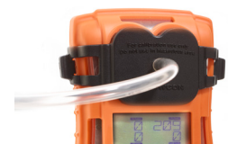
Bump/calibration plate To apply test gas to T4