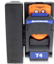
Vehicle charger Effective charging and storage whilst travelling