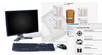
NEW Portables Pro 2.0 Software For easy configuration and servicing