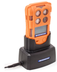
Cradle charger Docking station for easy charging