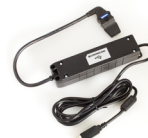
USB communications lead